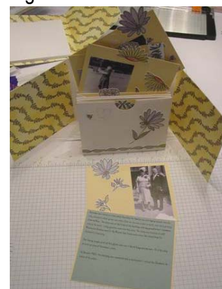
Pages with photos, journaling and die-cuts.

Finish album by decorating 4-1/2"x5-1/2" cards with self-adhesive die-cuts, photos and journaling. Notice in photo above that die-cuts stick up on cards, creating a "pull-tab". To remove stickiness from exposed portions of the die-cuts, apply cornstarch or baby powder and rub off excess. Place cards in envelopes and secure album with method of your choice.